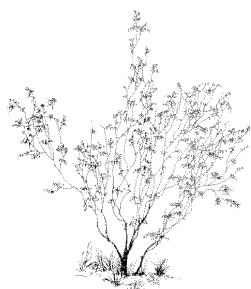
CREOSOTE A, B

As you tour the Museum look for these desert plants. Examine each and decide which adaptations, listed below, the plants use to survive in a desert environment. Write the corresponding letters in the spaces provided near each plant.