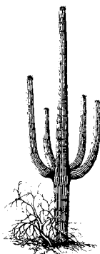
SAGUARO B, D, E, F