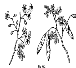
PALO VERDE TREE A, B, C, D